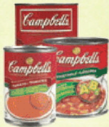
10oz / 284mL, 28oz / 796mL, 48oz / 1.36L condensed soup