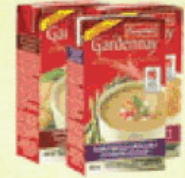
Gardennay - 500 mL / 1 L