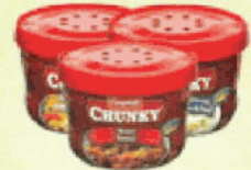
Chunky to Go Bowls - 420 mL