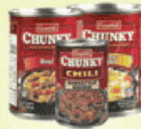
10 oz / 284 mL, 19oz / 540mL and 14oz / 425g soup or chili