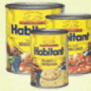
Habitant - 227 mL / 398 mL / 796 mL