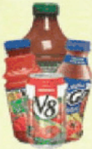
V8 / V8 Splash Beverage - 354 mL / 474 mL / 950 mL

All products are worth 1 point unless otherwise stated.