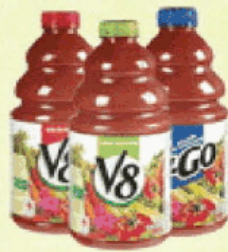
1.89L beverage or vegetable cocktail