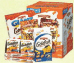
1.36 kg, 28g, 168g, 180g, 190g and 200g crackers