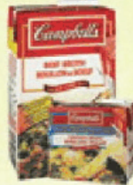
500mL and 900mL broth