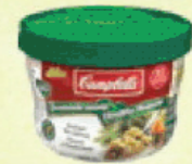
Campbell 's® Healthy Request® Bowls – 420 ml