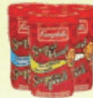
Soup at Hand - 284 mL