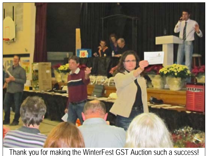
Thank you for making the WinterFest GST Auction such a success!