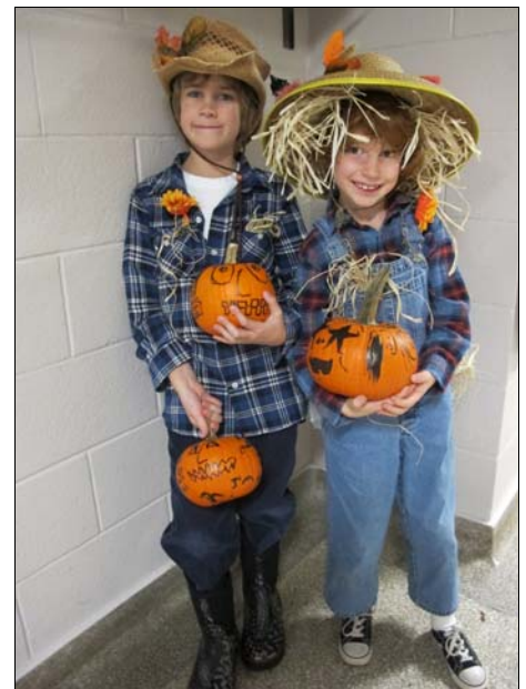
Pumpkin & Scarecrow Day