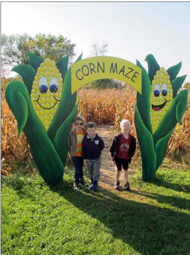
Junior & Senior Kindergarten visit Birtch Farms