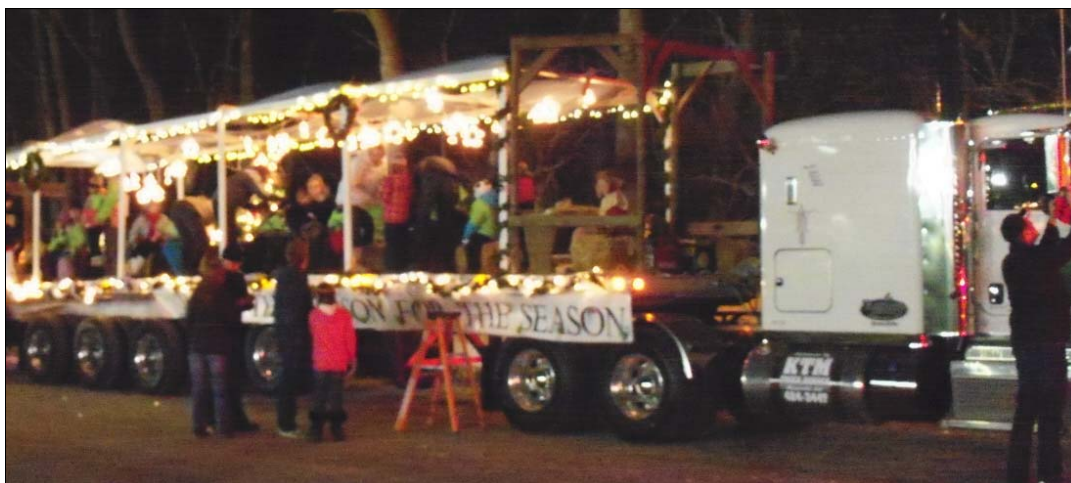
Getting the JKCS float and children ready for the Woodstock Santa Parade - Thanks to all the volunteers!