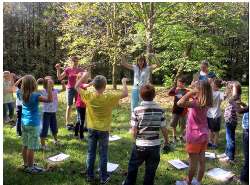
Grade 3 visit the Arboretum