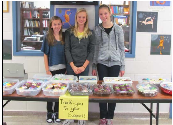
As part of our service learning at JKCS a bake sale was held to support three students who are preparing to participate in a mission trip to Nicaragua.