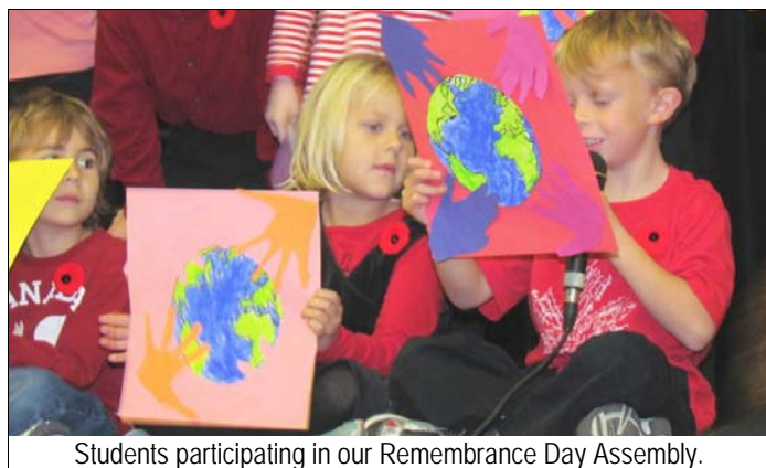
Students participating in our Remembrance Day Assembly.