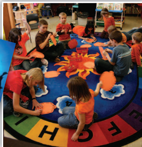
JK & Grade 4 buddy classes celebrate "Orange Day" with many hands on activities.